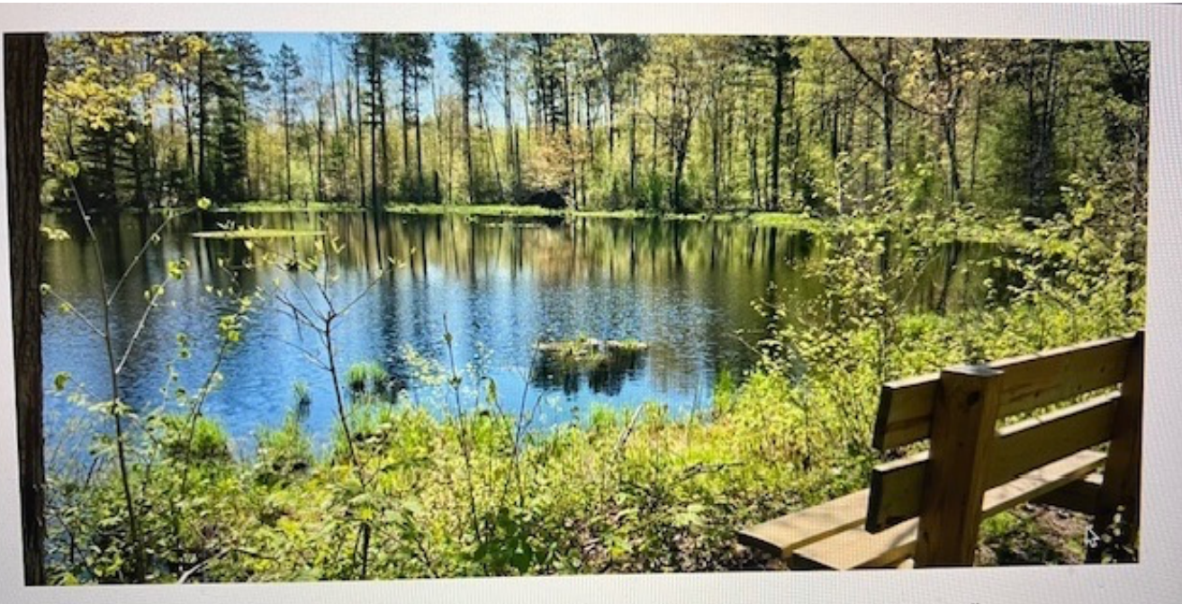
"Walk With Me, and I'll Take You Back Ten Thousand Years"

Email me at <a href="mailto:chippewamorainechapter@iceagetrail.org">chippewamorainechapter@iceagetrail.org</a> to let me know that you have received your new signed Volunteer Agreement.